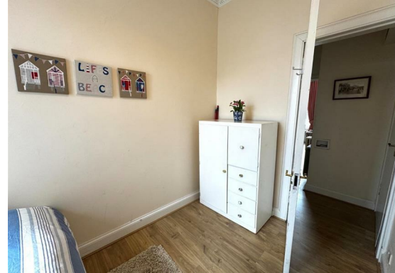
Bedroom 10'7" x 6'7" (3.23m x 2.01m)